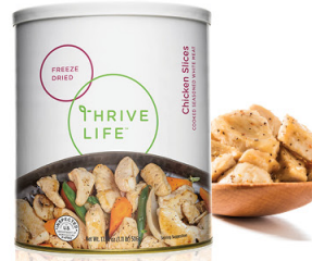
Chicken Slices AVAILABLE SIZES Pantry Can Family Can (#10)