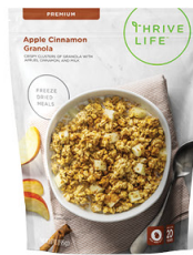
Apple Cinnamon Granola FD GF NG

Thrive Life meals are perfect for long-term food storage, backpacking, and busy families—just add water, and in minutes, enjoy a delicious and nutritious 3-serving meal anytime, anywhere!