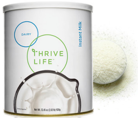
Instant Milk AVAILABLE SIZES Pantry Can Family Can (#10) GF NG