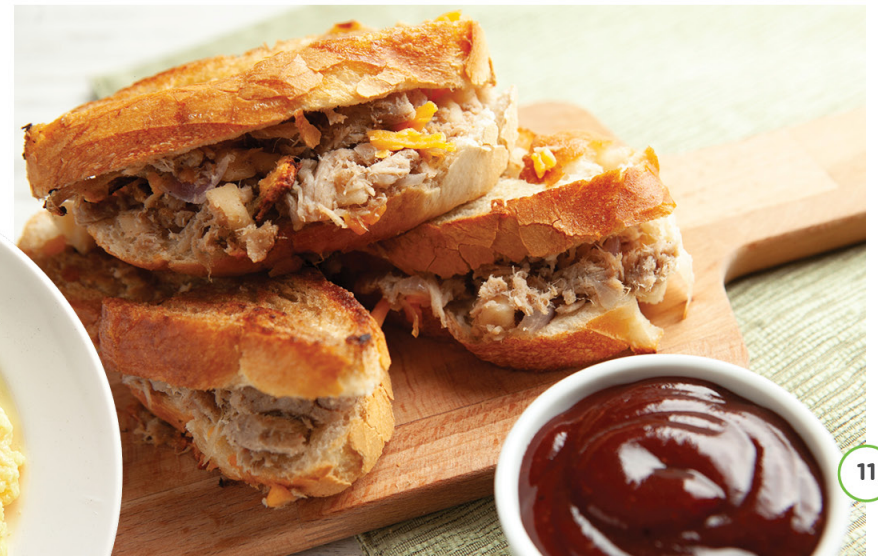
Apple Pulled Pork