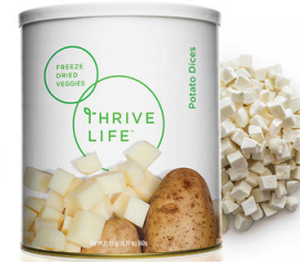
Potato Dices AVAILABLE SIZES Pantry Can Family Can (#10) FD GF NG