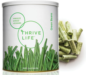
Green Beans AVAILABLE SIZES Pantry Can Family Can (#10) FD GF NG