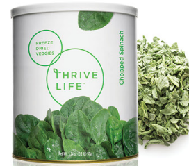
Chopped Spinach AVAILABLE SIZES Pantry Can Family Can (#10) FD GF NG