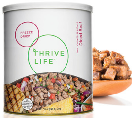
Diced Beef AVAILABLE SIZES Pantry Can Family Can (#10)