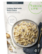
Creamy Beef with Rotini Pasta FD GF NG