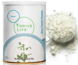
Sour Cream Powder AVAILABLE SIZES Pantry Can GF NG