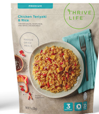
Chicken Teriyaki & Rice FD GF NG