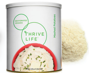
Mashed Potatoes (Dehydrated) AVAILABLE SIZES Pantry Can Family Can (#10) GF NG