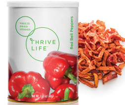
Red Bell Peppers AVAILABLE SIZES Pantry Can FD GF NG