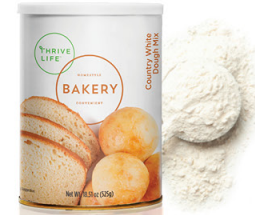
Country White Dough Mix AVAILABLE SIZES Pantry Can NG