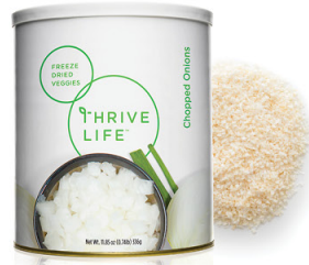
Chopped Onions AVAILABLE SIZES Pantry Can FD GF NG