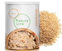
Instant Brown Rice AVAILABLE SIZES Pantry Can GF NG