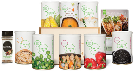
Contains pantry cans, and one seasoning can.

Eliminate the stress of planning and prepping with some of our best products and easy-to-follow recipe cards! Each pack comes with 9-10 Thrive Life ingredients with a list of pantry basics you'll need to finish off your recipes.