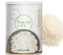
Instant White Rice AVAILABLE SIZES Pantry Can GF NG