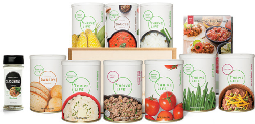
Contains pantry cans, and one seasoning can.