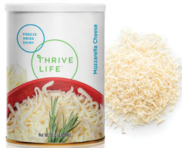
Mozzarella Cheese AVAILABLE SIZES Pantry Can FD GF NG