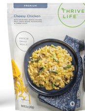
Cheesy Chicken FD GF NG