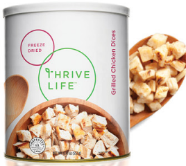
Grilled Chicken Dices AVAILABLE SIZES Pantry Can Family Can (#10)