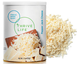
Pepper Jack Cheese AVAILABLE SIZES Pantry Can FD GF NG