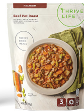
Beef Pot Roast FD GF NG