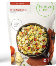
Breakfast Skillet FD GF NG