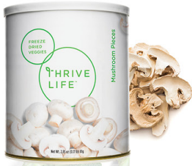
Mushroom Pieces AVAILABLE SIZES Pantry Can Family Can (#10) FD GF NG