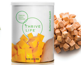
Butternut Squash AVAILABLE SIZES Pantry Can FD GF NG