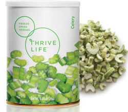
Celery AVAILABLE SIZES Pantry Can FD GF NG