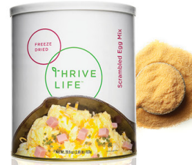
Scrambled Egg Mix AVAILABLE SIZES Pantry Can Family Can (#10)