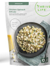
Blueberry Oatmeal FD GF NG