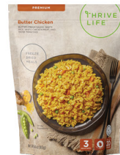
Butter Chicken FD GF NG