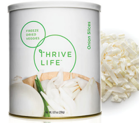
Onion Slices AVAILABLE SIZES Pantry Can Family Can (#10) FD GF NG