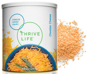
Cheddar Cheese AVAILABLE SIZES Pantry Can Family Can (#10) FD GF NG

With Thrive Life, you can always have dairy products for everyday use or long-term storage—without worrying about spoilage!