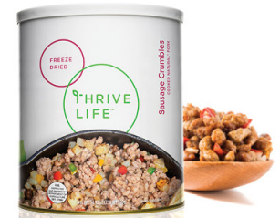
Sausage Crumbles AVAILABLE SIZES Pantry Can Family Can (#10)