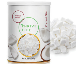
Coconut Bites AVAILABLE SIZES Pantry Can FD GF NG