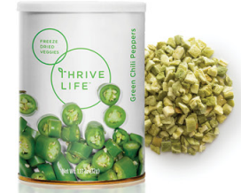
Green Chili Peppers AVAILABLE SIZES Pantry Can FD GF NG