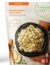
Creamy Mashed Potato Bowl FD GF NG