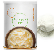
Butter Powder AVAILABLE SIZES Pantry Can GF NG

Thrive Life basics are kitchen essentials—from sauces, seasonings, grains, and more, they add flavor and make cooking a breeze!