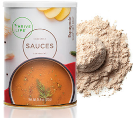
Espagnole (Savory Beef Gravy) AVAILABLE SIZES Pantry Can GF NG