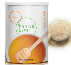
Honey Crystals AVAILABLE SIZES Pantry Can GF NG