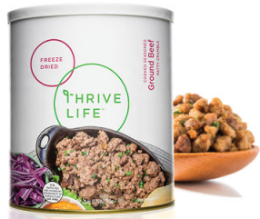
Ground Beef AVAILABLE SIZES Pantry Can Family Can (#10)

Thrive Life proteins are mealtime superheroes—whether you're whipping up main dishes or wanting a hearty boost of protein, we've got you covered!