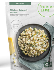
Chicken Spinach Alfredo FD GF NG