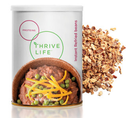
Instant Refried Beans AVAILABLE SIZES Pantry Can