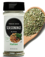
Italian Seasoning Blend AVAILABLE SIZES Pantry Can FD GF NG