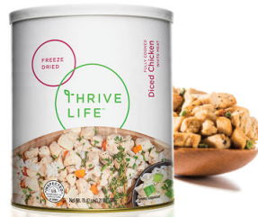
Diced Chicken AVAILABLE SIZES Pantry Can Family Can (#10)