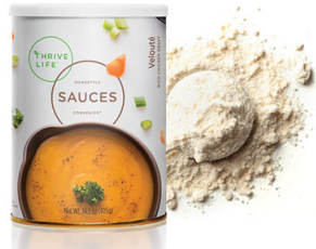
Velouté (Rich Chicken Gravy) AVAILABLE SIZES Pantry Can GF NG