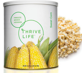
Sweet Corn AVAILABLE SIZES Pantry Can Family Can (#10) FD GF NG