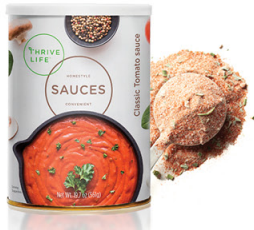
Classic Tomato Sauce AVAILABLE SIZES Pantry Can GF NG