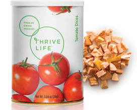
Tomato Dices AVAILABLE SIZES Pantry Can FD GF NG

Visit the Thrive Life website to view the latest in our seasonal and limited-run vegetables like Green Onions and Kale.