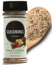
Chef's Choice Seasoning Blend AVAILABLE SIZES Pantry Can GF NG