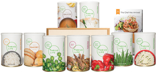
Contains pantry cans.