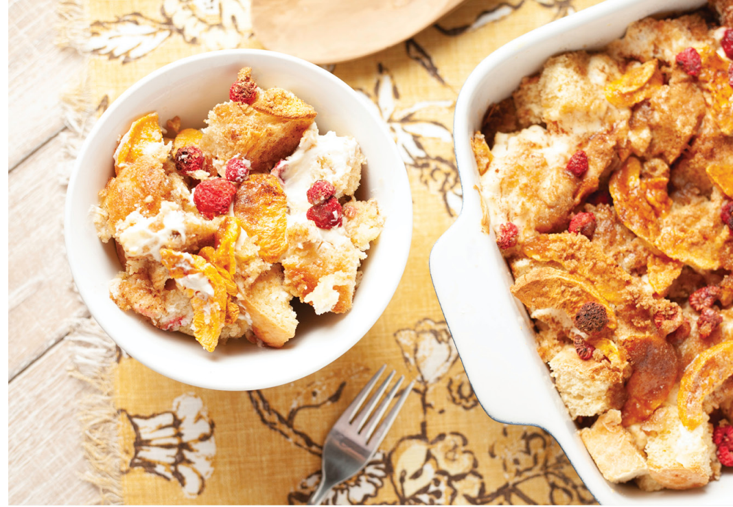
Overnight Raspberries, Peaches, and Cream Cheese French Toast