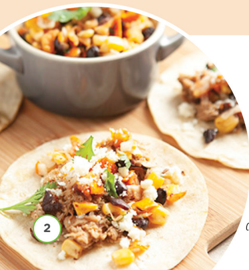
Coca Cola™ Street Tacos

Create effortless smoothies with our fruits (and you can even add Thrive Life Spinach, Kale, or other veggies for extra nutrition).