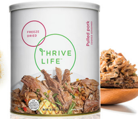
Pulled Pork AVAILABLE SIZES Pantry Can Family Can (#10)