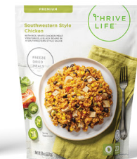
Southwestern Style Chicken FD GF NG