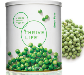
Green Peas AVAILABLE SIZES Pantry Can Family Can (#10) FD GF NG