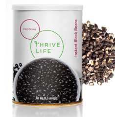
Instant Black Beans AVAILABLE SIZES Pantry Can