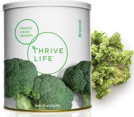
Broccoli AVAILABLE SIZES Pantry Can Family Can (#10) FD GF NG

Thrive Life veggies are pre-washed and pre-cut, a kitchen game-changer —eat them straight from the can and use as the ultimate time-saver for delicious recipes!